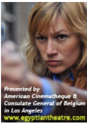
Presented by American Cinematheque & Consulate General of Belgium in Los Angeles www.egyptiantheatre.com